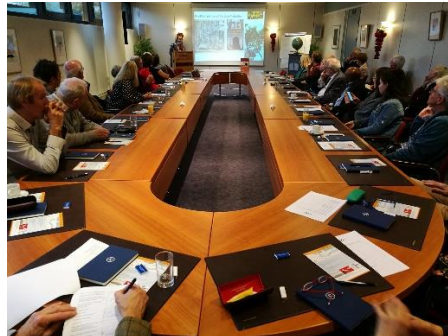
The Amsterdam Rasphuis on the screen. Pau do Brasil for the uniforms of the French armee.